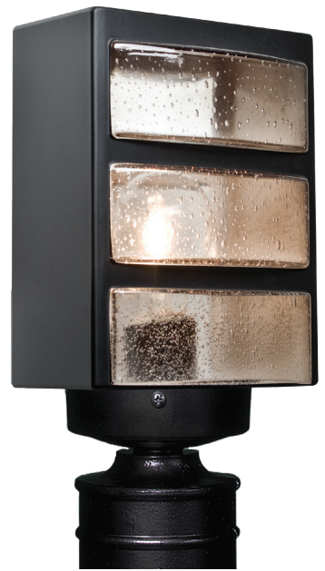
351358-POST Black/Smoke Bubble with Post Fitter