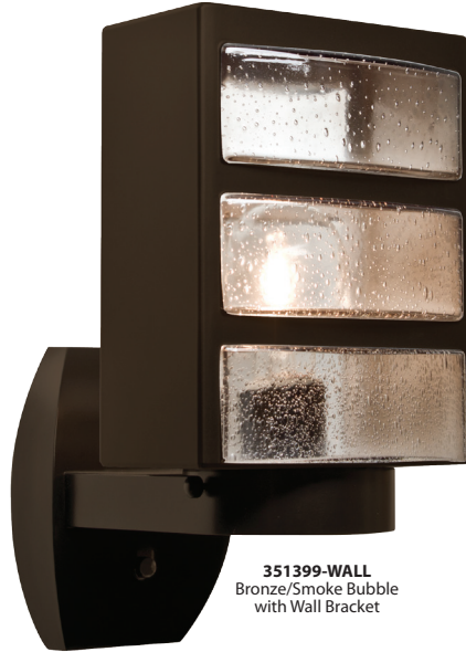
351399-WALL Bronze/Smoke Bubble with Wall Bracket

UL or ETL Listed. Suitable for Wet Locations. May be used in Interior or Exterior applications.